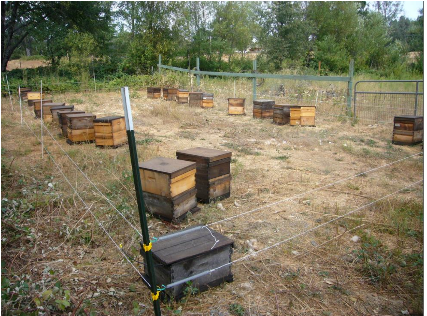
Typical fence after weed whacking the blackberry vines around the perimeter.