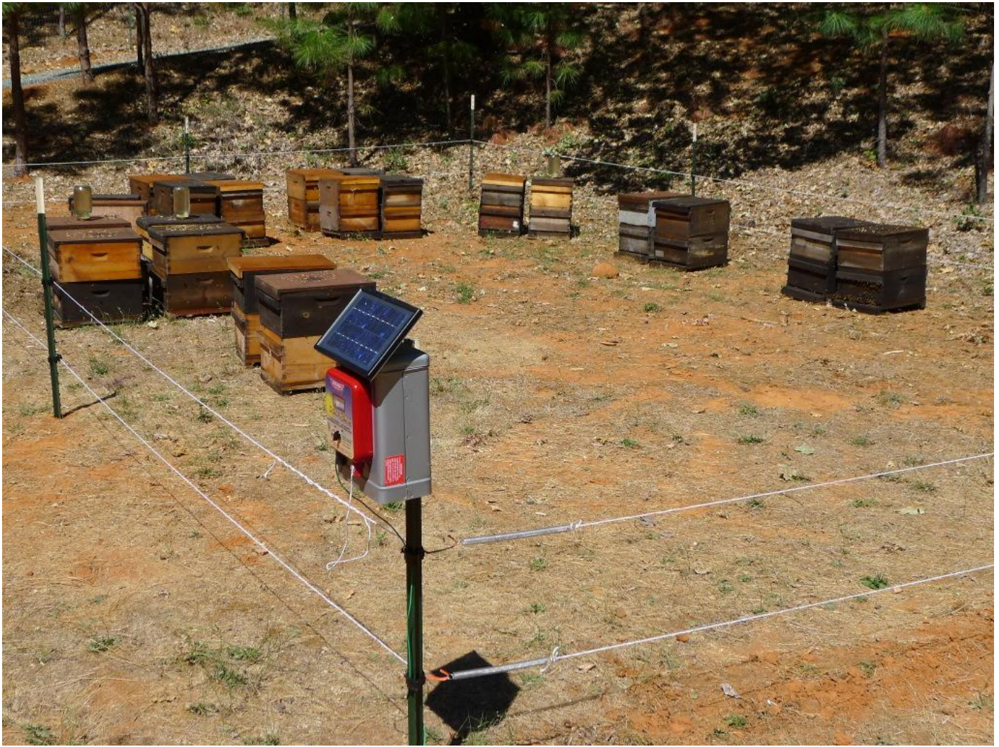
Typical fence during dry season. When soil is this dry, you may need to water or lay down a chicken wire ground.