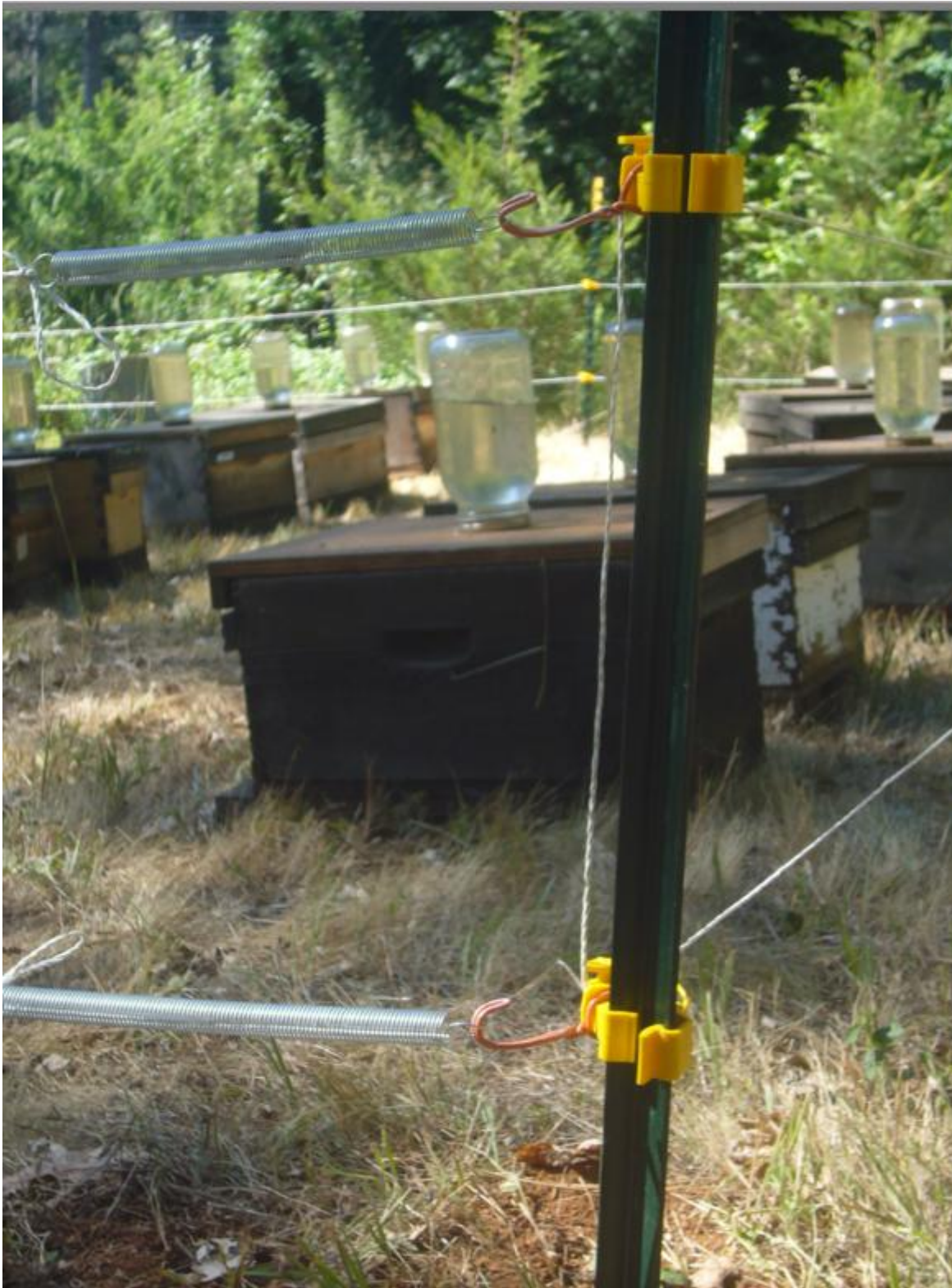
Corner detail. The orange 12-ga hook is twisted to the insulator, and must not contact the fencepost.