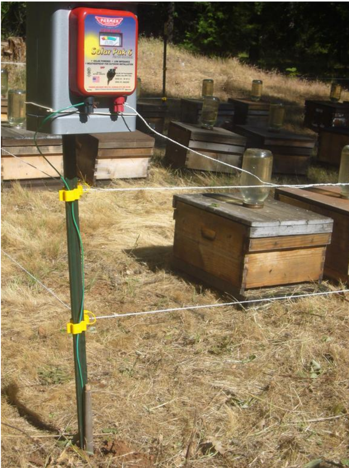
Solar charger, ground wire protected from weed whacker and then run shallowly underground to the ground rod (not shown). Note detail of how I attach the hot jumper—I unwind a bit of the hot wire and weave the jumper into it.