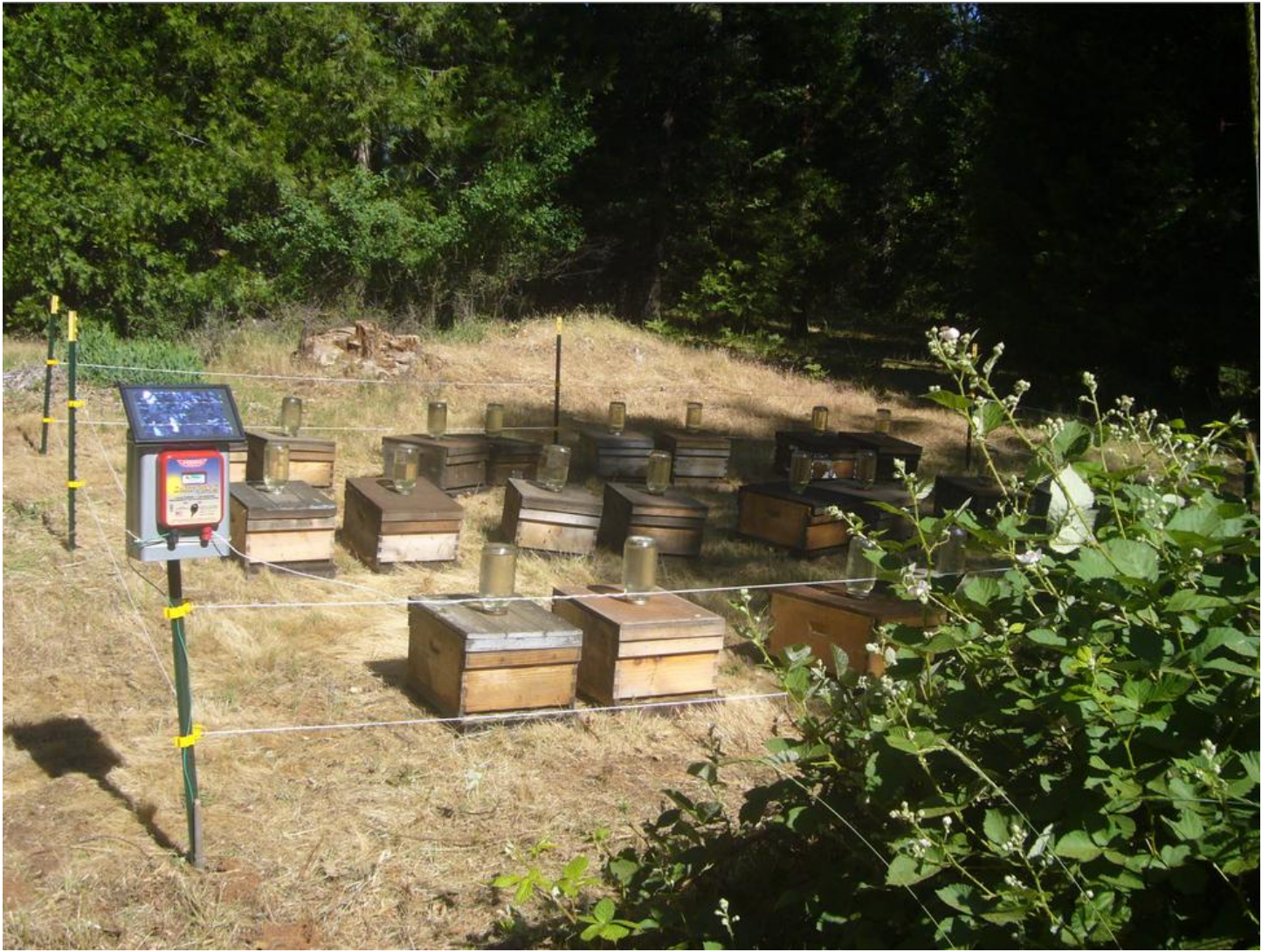
Typical fence—blackberry bloom about to begin! I maintain a 3-ft path between the fence and the blackberries.